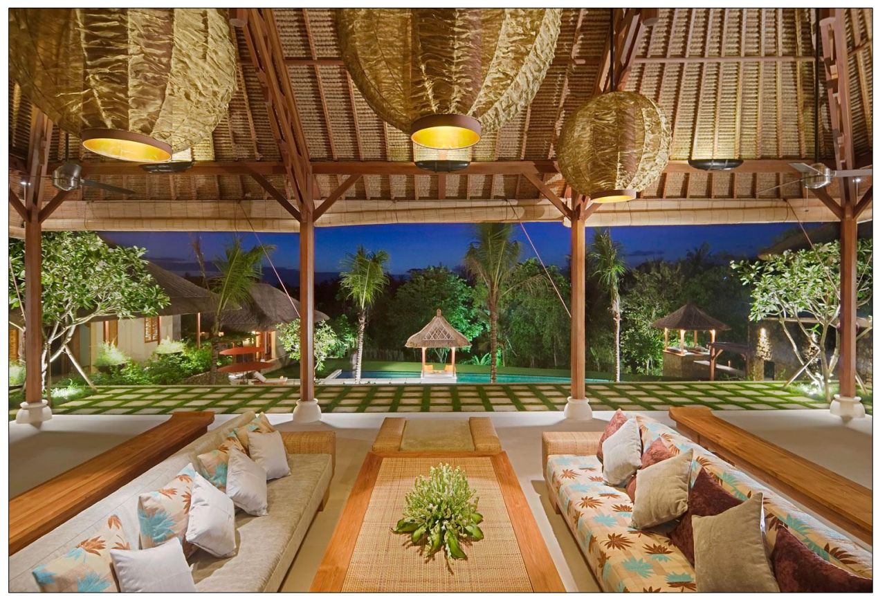
Luxurious ... Puri Bawana.